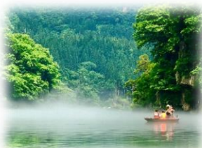
Mugenkyo No Watashi