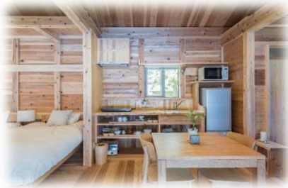
Simple, yet stylish room.