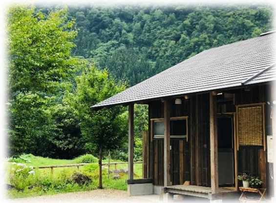
【B】 Kawaberi Cottage

It is a small cottage standing in a small village called Hayato Honson. Surrounding the cottage, there are many traditional Japanese houses. The cottage is equipped with a wood stove and a bathtub made of paulownia tree.