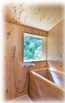
Bathtub made of paulownia tree. Bathroom wall is made of hinoki cypress.