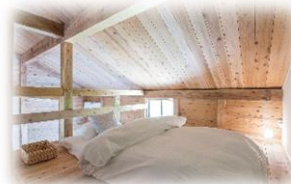
Loft. (It can be used as a bedroom with Futon.)