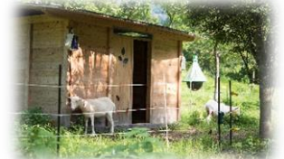
Kawagiri Sakura hiking route,