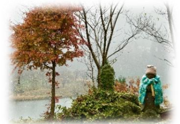
Mugen Jizo statue