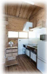
Kitchen equipped with necessary cooking utensils.