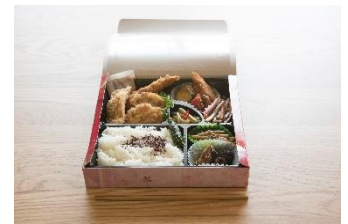
Bento Box 1,000 Yen