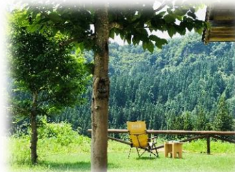
View of majestic river valley.