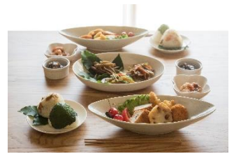
Dinner for two.