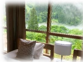
View from Bedroom.