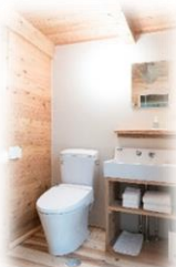
Toilet with WASHLET.