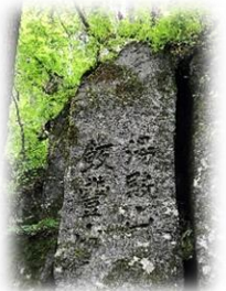
【Road of Gods】 There are shrines and jizo statues.