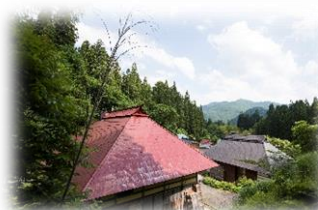
Traditional Houses in neighborhood