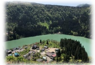
View of Mugenkyo Valley