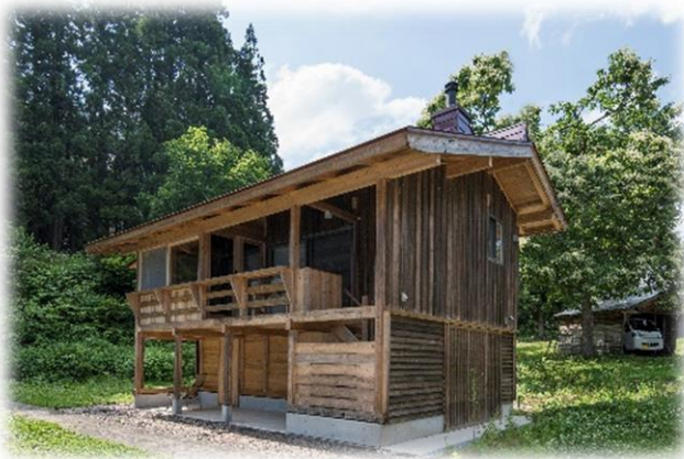
【A】 Honson Cottage

It is a small cottage standing in a small village called Hayato Honson. Surrounding the cottage, there are many traditional Japanese houses. The cottage is equipped with a wood stove and a bathtub made of paulownia tree.