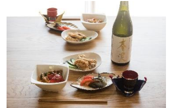
Appetizer for two. (Alcohol is not included.)